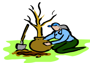
Cool days and moist mornings help new plants take hold before winter.

Water-wise gardeners have long recognized the value of fall planting. As days shorten and nights lengthen, plants transpire less and require less water. Strong roots begin to develop in the warm soil, and soaking winter rains encourage them to penetrate deeper. For the most part, anything with the exception of frost-tender plants can be planted now.